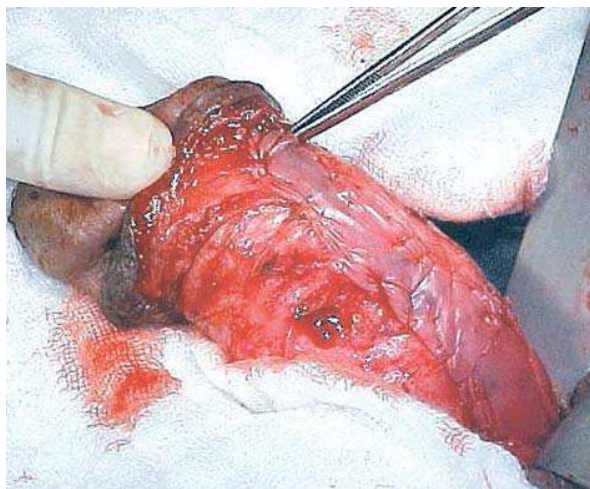
Figure 3 – Bovine pericardium lining the prosthesis.

There were no complications observed in the immediate postoperative period. After 8 weeks, all