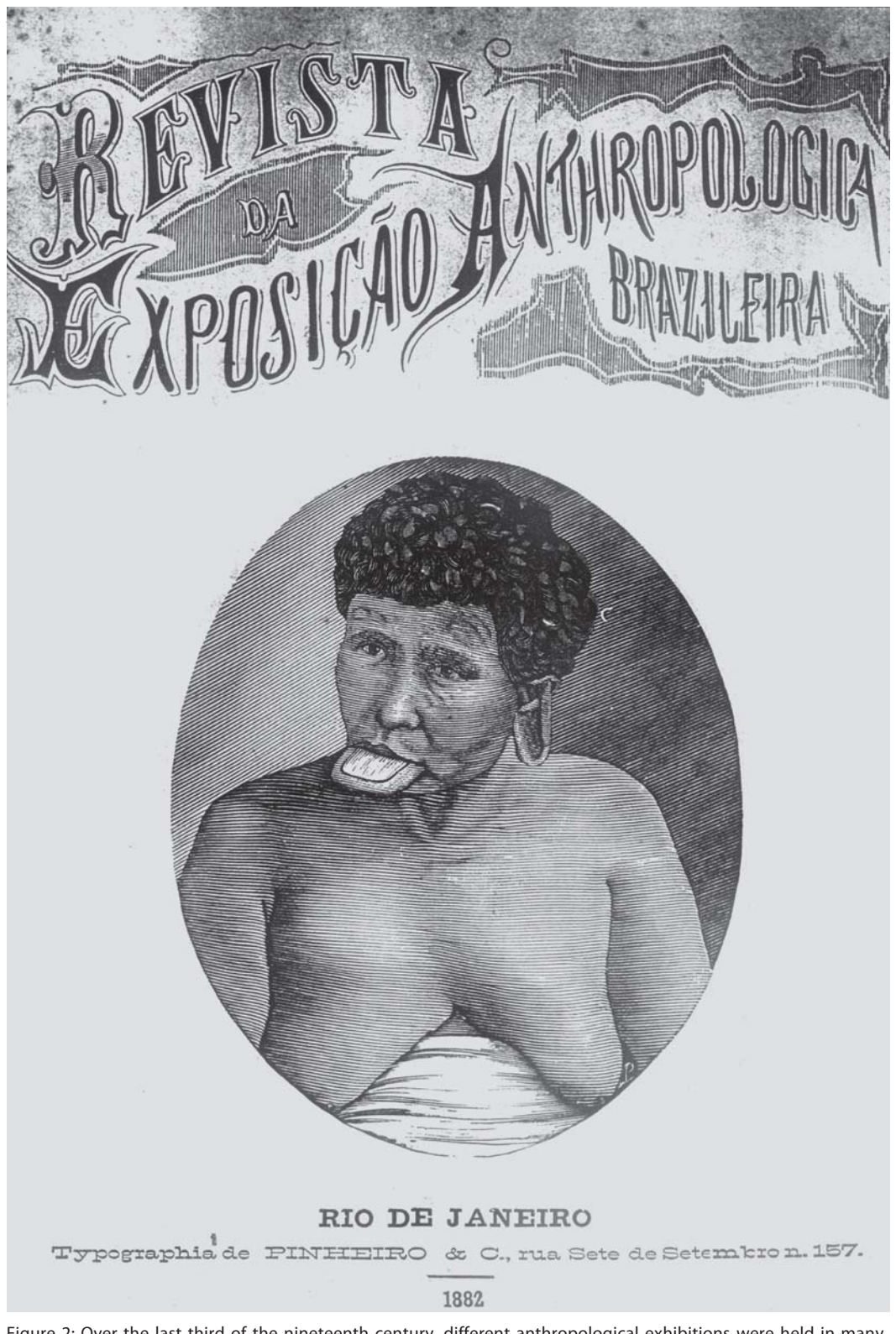
Figure 2: Over the last third of the nineteenth century, different anthropological exhibitions were held in many countries, where natives were exposed to the public as a main attraction. The image above shows the cover of the Revista da Exposição Antropológica Brazileira (Brazilian Anthropological Exposition Magazine). This exhibition was organized by the National Museum of Rio de Janeiro. A group of Botocudos were described within the exhibition as living fossils, current representatives of primitive stages in human evolution