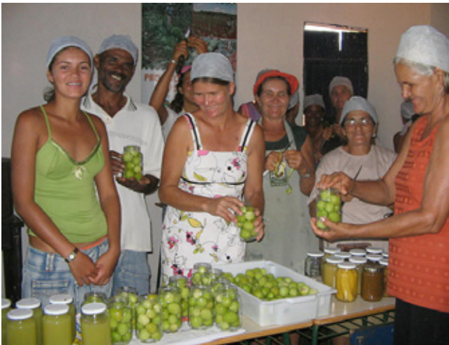
Figure 3. Storage and use of surplus fruit

Along with increased production of fruit, vegetables and legumes, farmers now have the incentive and will to speak up in associations to promote the sale of surplus produce. With IPB support in project preparation, the new associations have managed to buy sheds for shared use and pulpers to enable them to sell some of their produce in already industrialised form as juice pulp and jellies, thus seeking to increase family income and prevent waste (see figure 3).