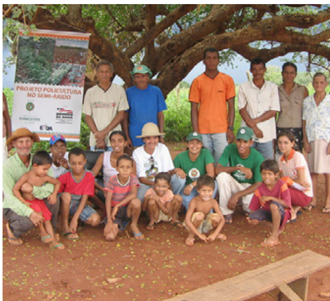
Figure 4. Farmers and their families in the project

Social capital (trust among stakeholders) was improved to the extent that in most cases, polyculture fields have been planted and managed jointly. The sale of surplus produce has also been organised on a collective basis through one of the associations created as a result of the project.