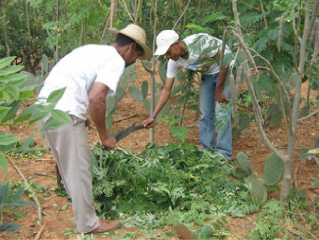
Figure 6. Farmers covering soil

Another important feature that was observed is that by cultivating different species in the same area, the area itself becomes more resistant to pests, dispensing with the need for chemical pesticides.