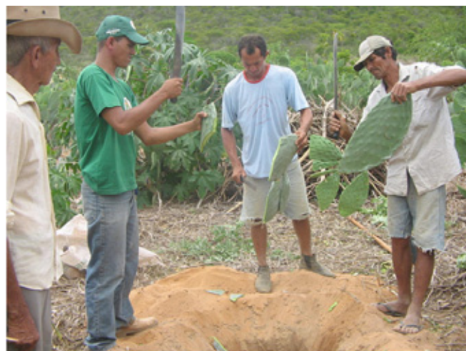
Figure 5. Farmers chopping palms, plants native to Caatinga, that are about 90% water, to prepare the soil

One of the techniques applied was the use of palm and mandacaru, plants native to Caatinga, chopped into small pieces and then placed in holes around other crops (see figure 5). Since palm and mandacaru naturally store a lot of water, they therefore release some of this for use by other plants.