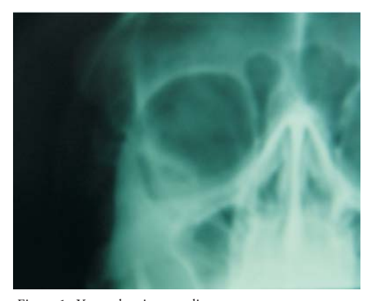
Figure 1- X ray showing a radiopac

Under general anesthesia, the bony lesion was completely removed, with no intercurrence. This lesion was not connected to the bone (FIGURE 3); it was located between the zigomatic arch, under the skin and on the muscles. During the surgery procedure, the diagnosis was changed to dermis osteoma (FIGURE 4). Microscopic examination of the specimen confirmed the proposed diagnosis. It was performed six months follow up, with no recurrence.