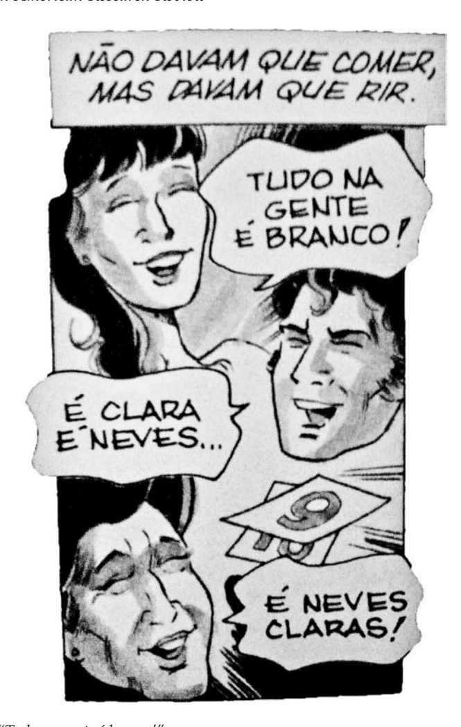
Figure 1 "Tudo na gente é branco!"

imagine that Cândido is anything but a binary reflection of Arminda. Moraes (2009, 6), for example, is typical in this regard, stating that in "Pai contra mãe," Machado depicts the struggle "of a white father and a black slave mother." For Moraes, it is a question of naturalized and fixed categories in opposition. Cândido hunts slaves for a living; his white child lives and the black child dies. Operating from within this binary schematic, it seems impossible that "Pai contra mãe" functions as anything but a commentary on white versus black.