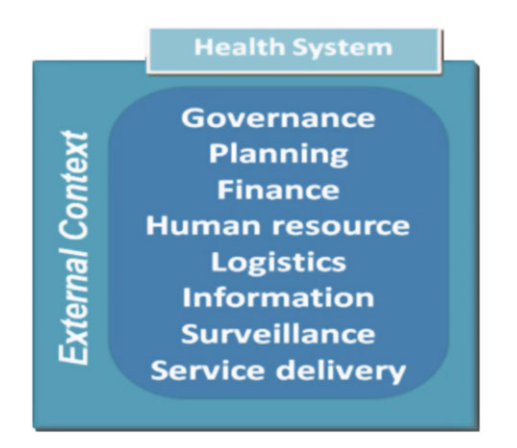
Figure 1. Health systems framework used in the study.

Methods for collecting primary data included key informant interviews, focus group discussions (where appropriate), and staff profiling surveys. Fieldwork took place between November 2009 and April 2010. In each country, interviews were conducted at national level and at service delivery level in either one or two selected districts. Key informants were selected on the basis of their experience in